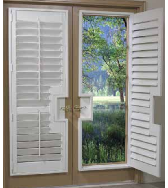
Rectangular cut out shown with 3 1/2" louvers and optional offset back plate & divider rail